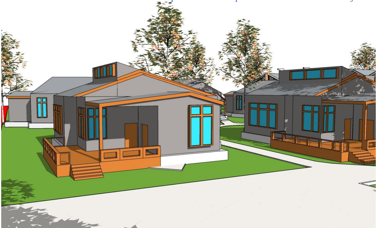
Schematic showing accommodation areas