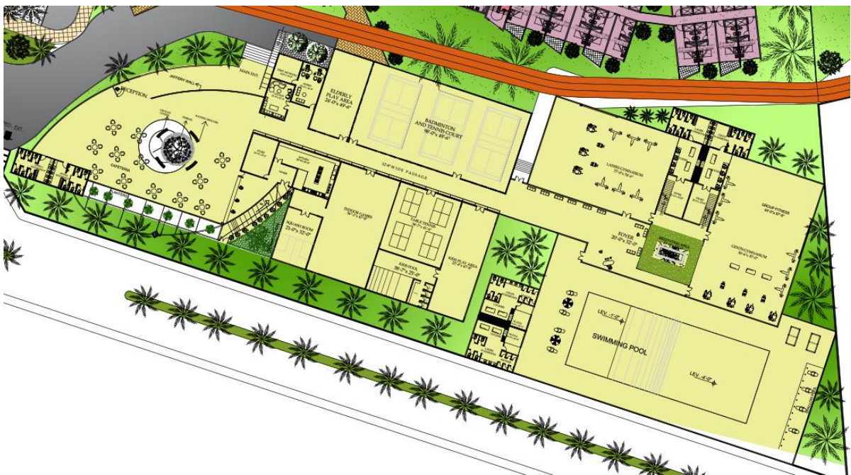
Plan showing indoor facilities