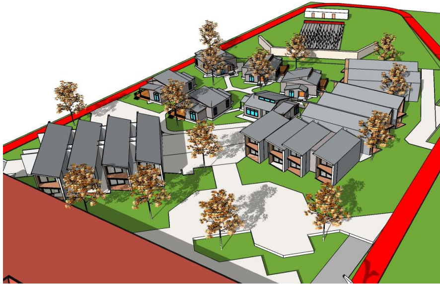
Conceptualization of accommodation facilities