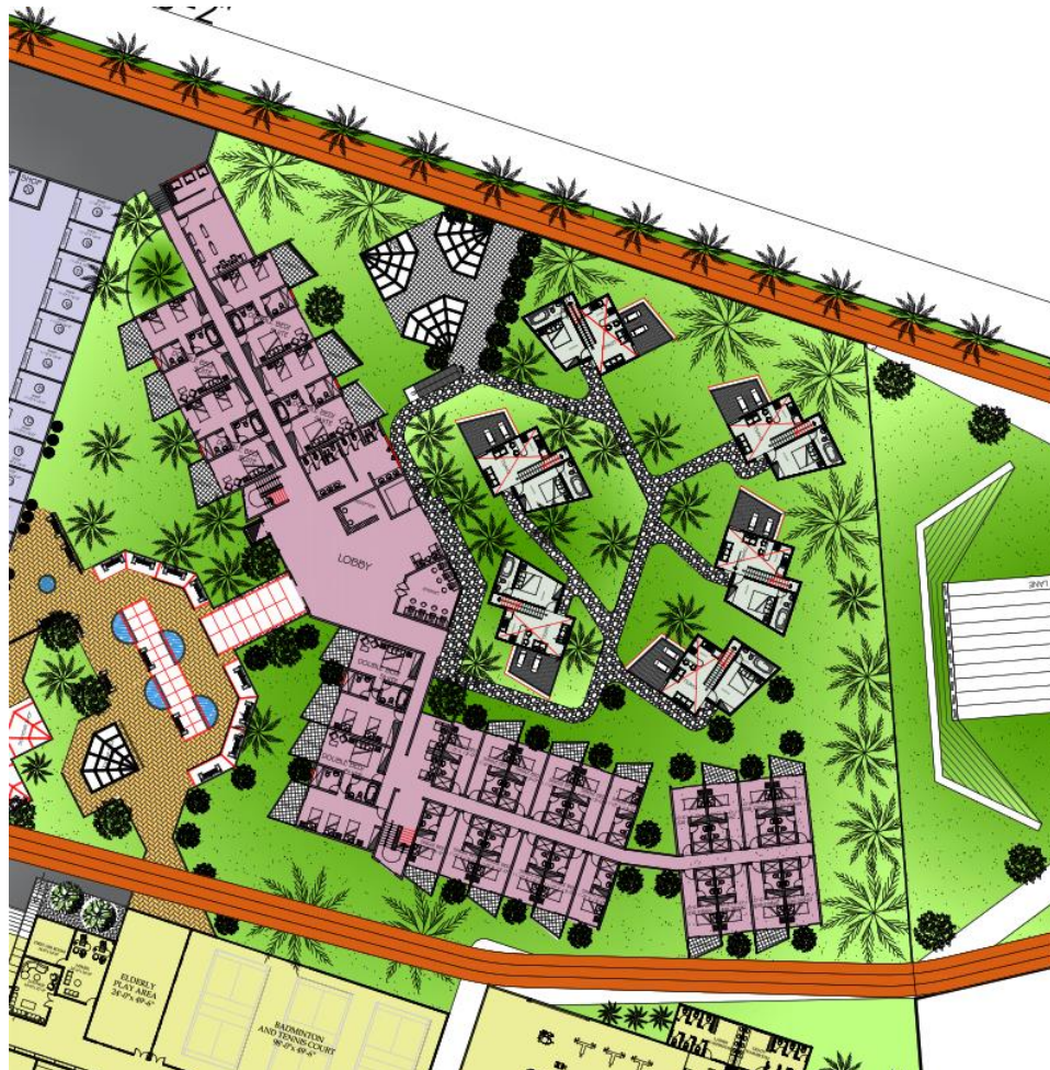
Plan showing accommodation blocks