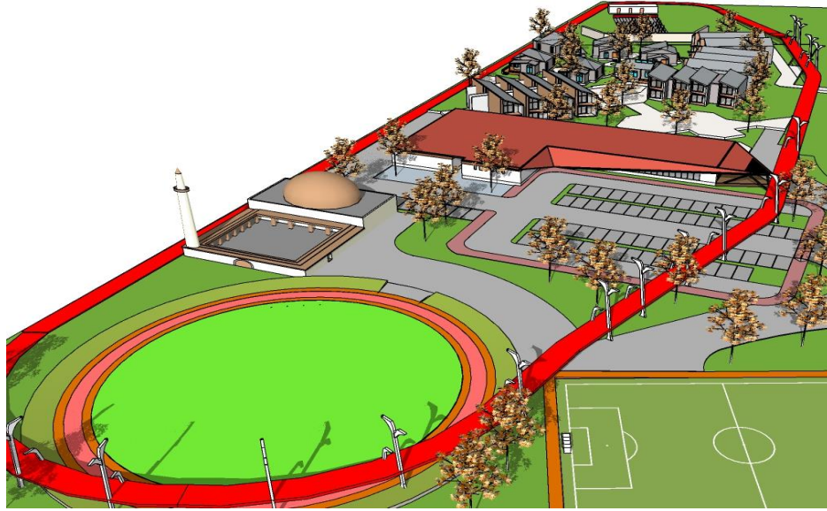
A view of Outdoor Areas

Prequalification / Expression of Interest for JV Project be entitled to bring in investment for construction of the Complex, & GDA will facilitate the JV Partner for long term arrangement.