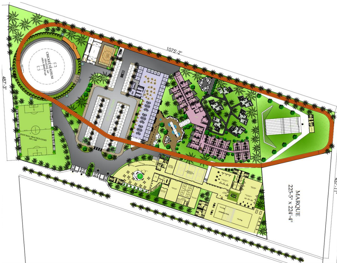
Proposed Master Plan of GDA Club