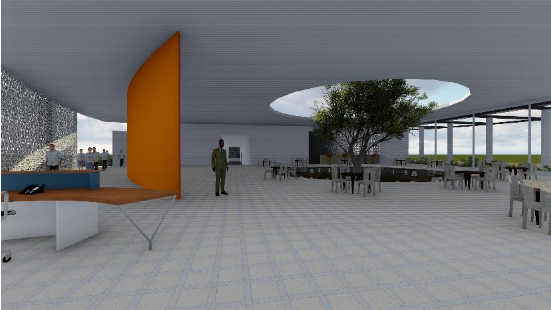
Conceptual Visuals of Indoor Areas