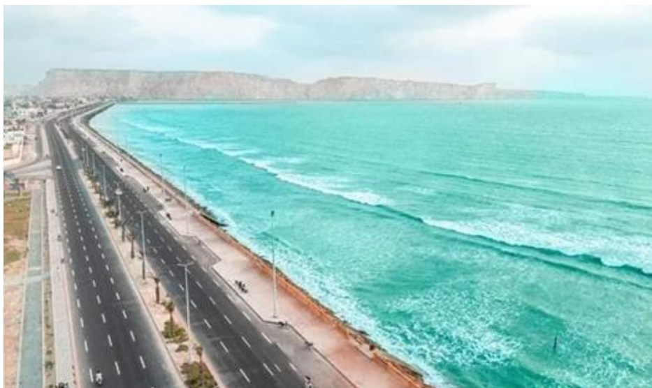
West bay Marine drive, Gwadar