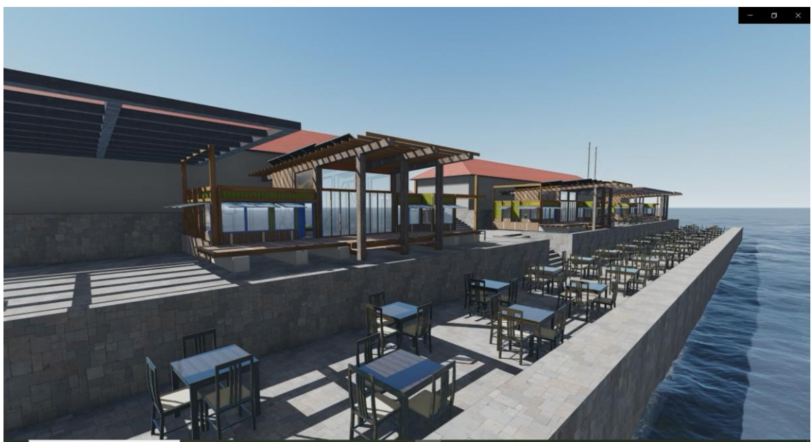
A view of Indoor/Outdoor Areas of Food Street (Ph 1 & 2)