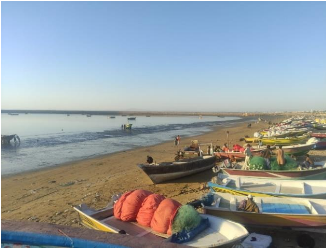
Proposed site looking Northwards