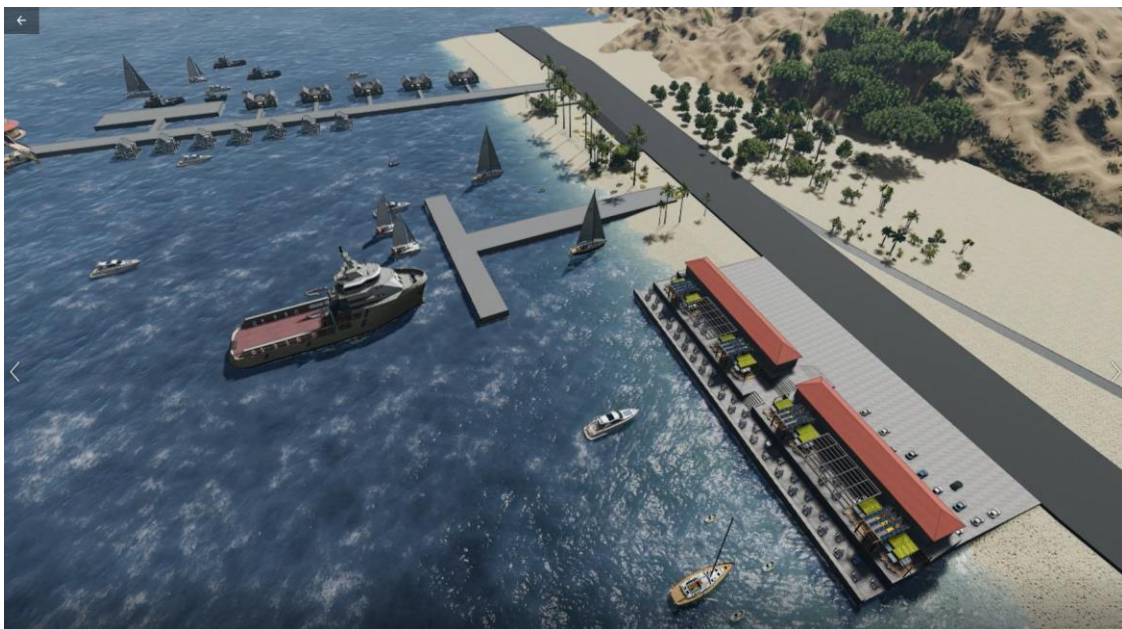
A Conceptual Master Plan for Food outlets and Allied facilities (Phase 1 & 2)