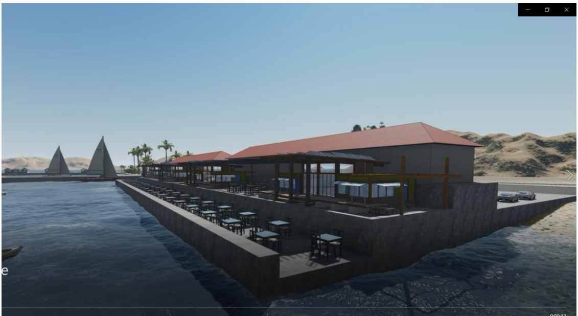
A view of Food Street (Ph-1 & 2)