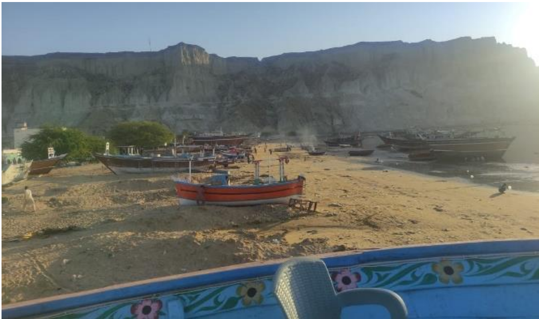
Proposed site looking westwards

The West bay with the scenic view of Marine drive & Koh-e-Batail makes it one of the unique landscapes. Such an environment is ideal for tourist attraction.