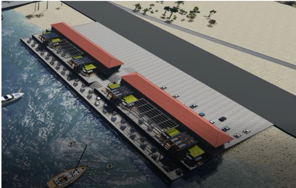
Conceptual Design of Food street (Ph-1)