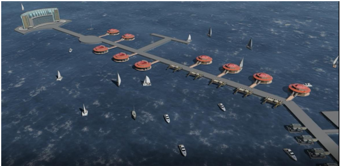
A futuristic conceptualization of West bay along Breakwater (not in Scope)