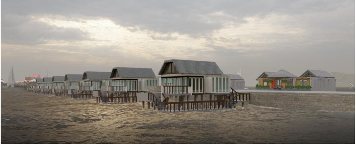
Futuristic View of Restaurant/Food outlets (not in Scope)