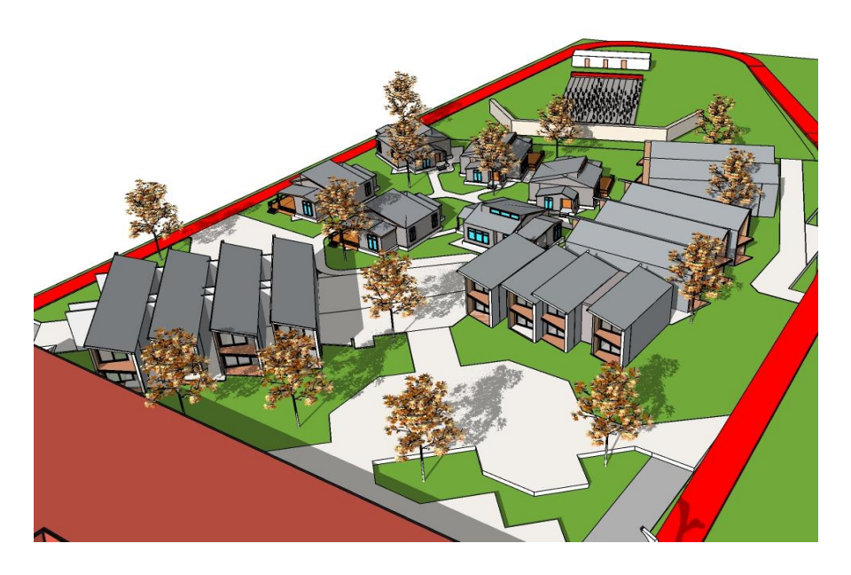
Conceptualization of accommodation facilities