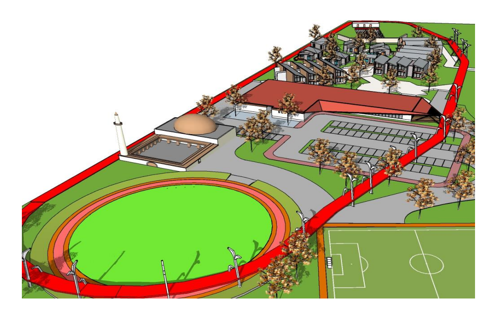
A view of Outdoor Areas

\frac{Prequalification \, / \, Expression \, of \, Interest \, for \, JV \, Project}{be \, entitled \, to \, bring \, in \, investment \, for \, construction \, of \, the \, Complex, \, \& \, GDA \, will \, facilitate \, the \, JV \, Project} Partner for long term arrangement.