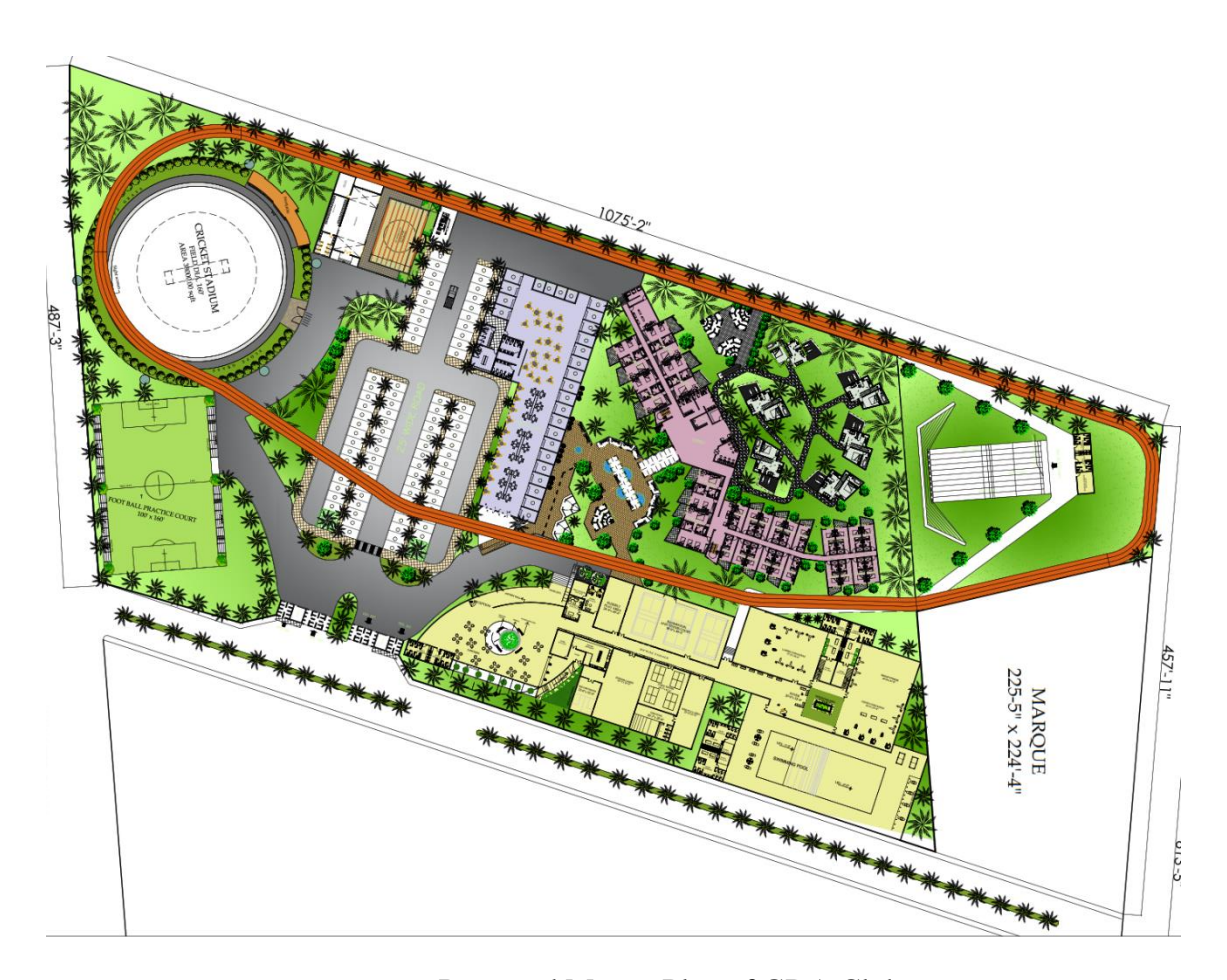
Proposed Master Plan of GDA Club