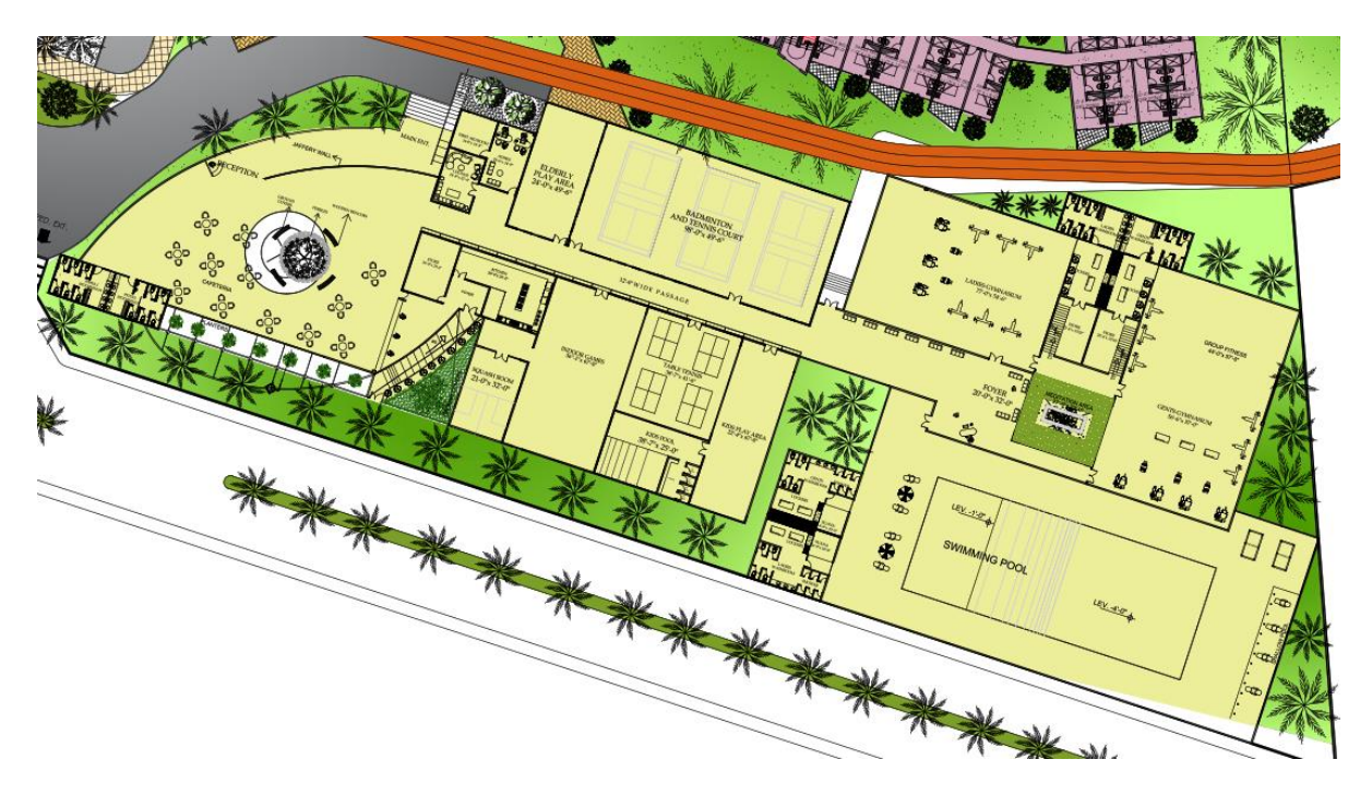
Plan showing indoor facilities