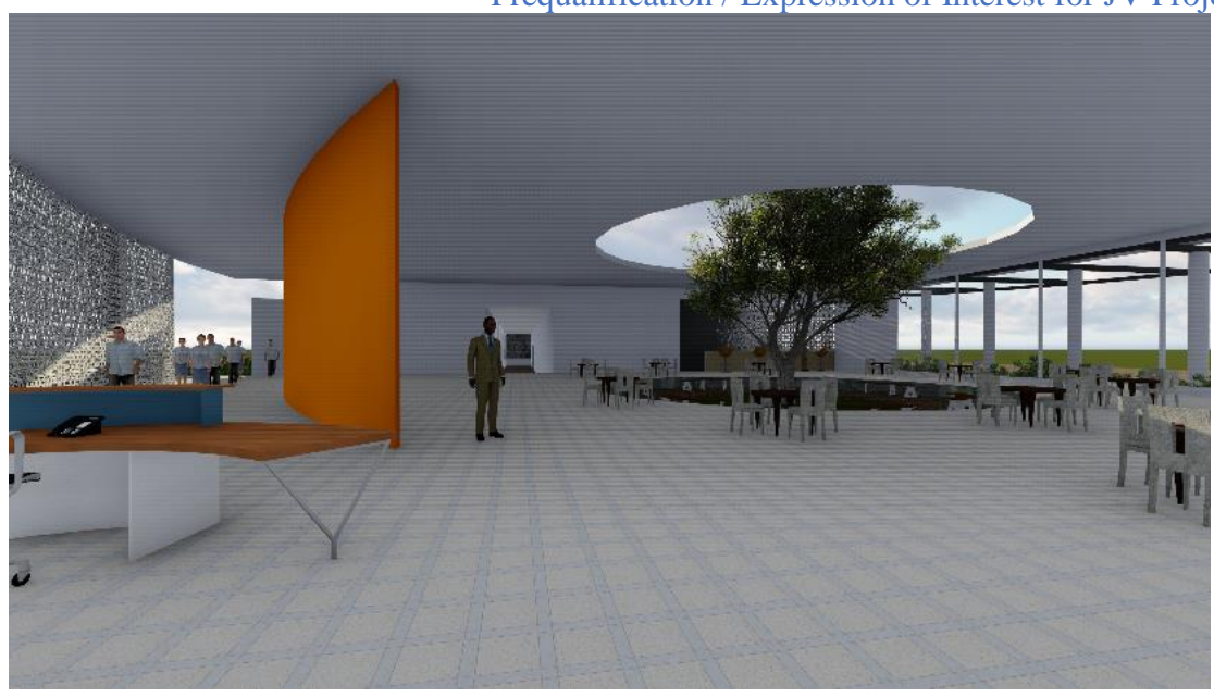
Conceptual Visuals of Indoor Areas