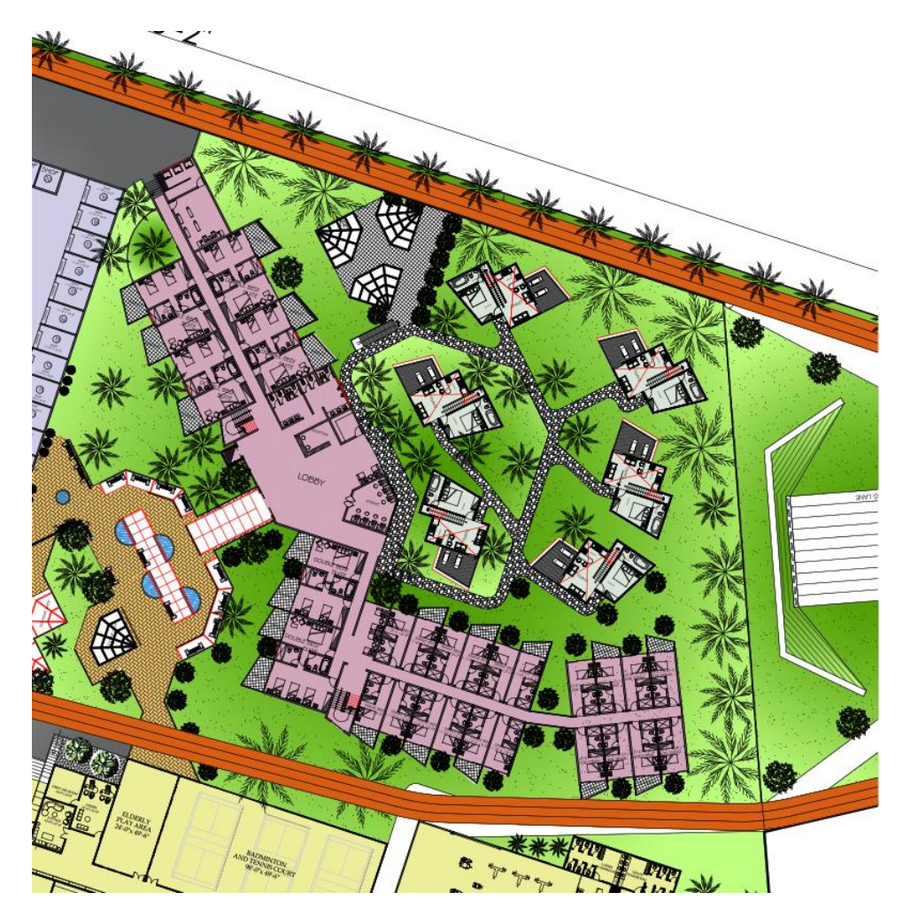
Plan showing accommodation blocks