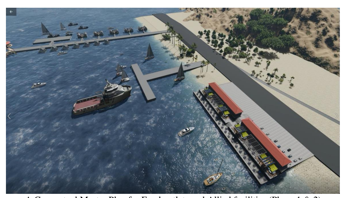
A Conceptual Master Plan for Food outlets and Allied facilities (Phase 1 & 2)