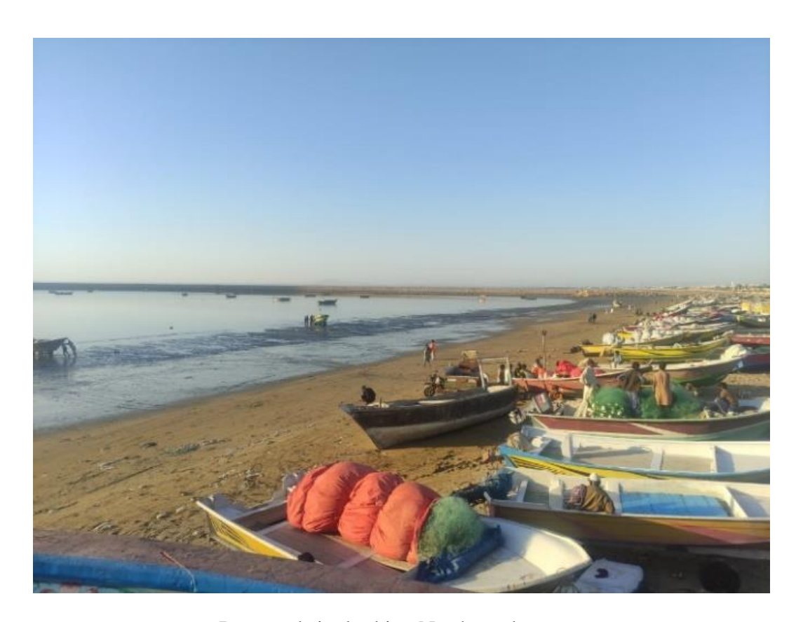
Proposed site looking Northwards