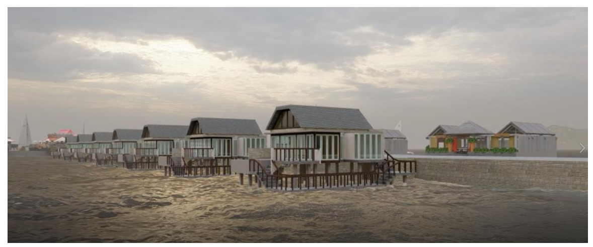
Futuristic View of Restaurant/Food outlets (not in Scope)