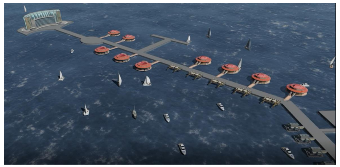
A futuristic conceptualization of West bay along Breakwater (not in Scope)