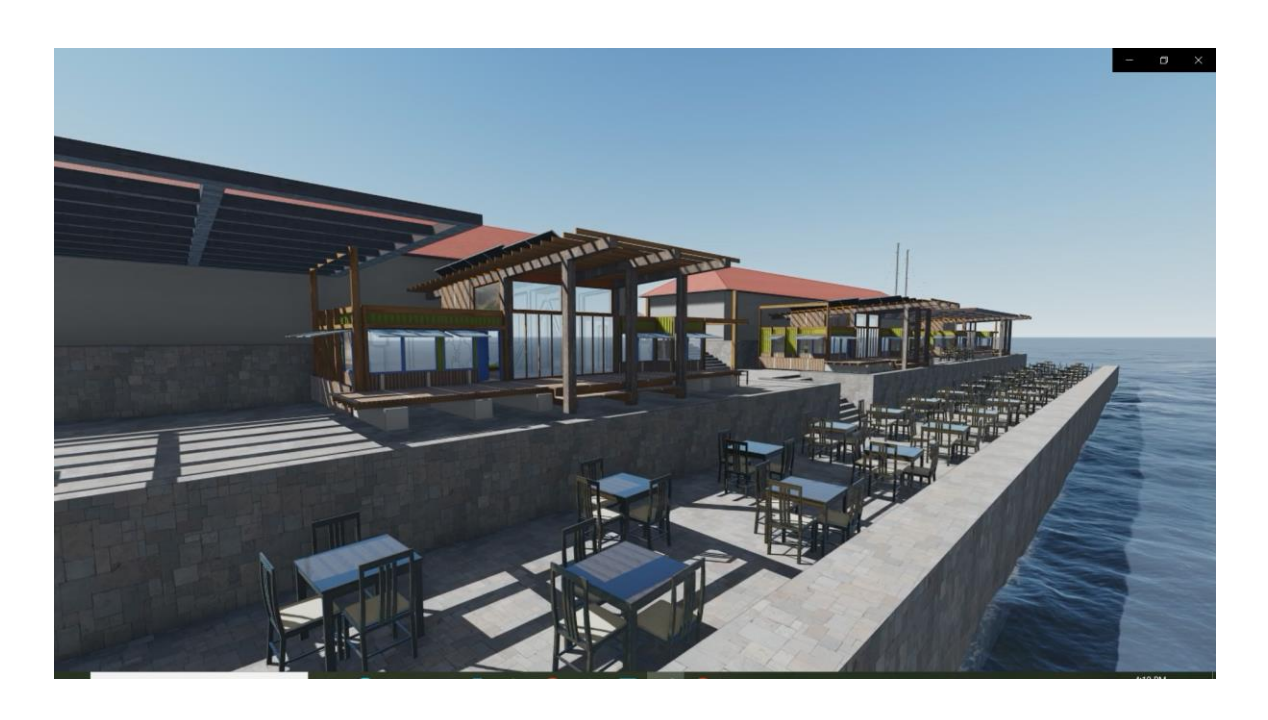
A view of Indoor/Outdoor Areas of Food Street (Ph 1 & 2)