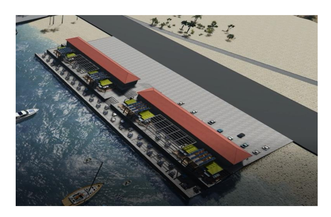
Conceptual Design of Food street (Ph-1)