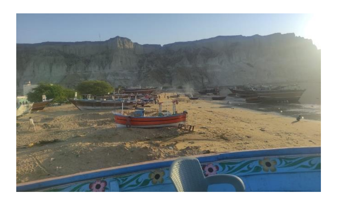
Proposed site looking westwards

The West bay with the scenic view of Marine drive & Koh-e-Batail makes it one of the unique landscapes. Such an environment is ideal for tourist attraction.