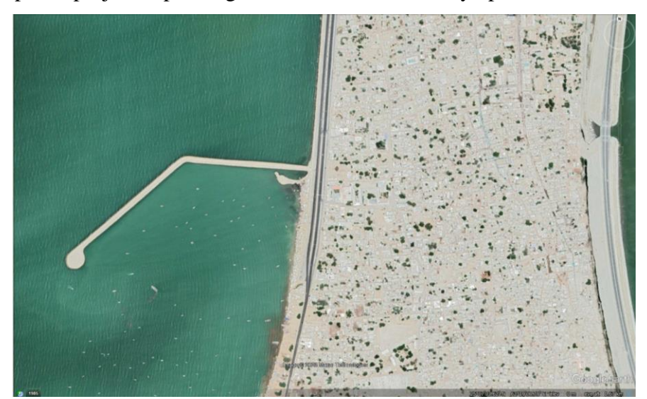
Westbay, Eastbay & Old Town Gwadar

Similar to food street development of DHA Ph- 8 " Do Daria " Karachi, that transformed from few huts into high end food street, within span of 5 Years. It is planned that same phasing will be followed in proposed project depending on the level of service by operators & clientele.