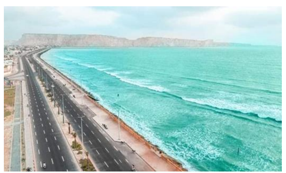
West bay Marine drive, Gwadar