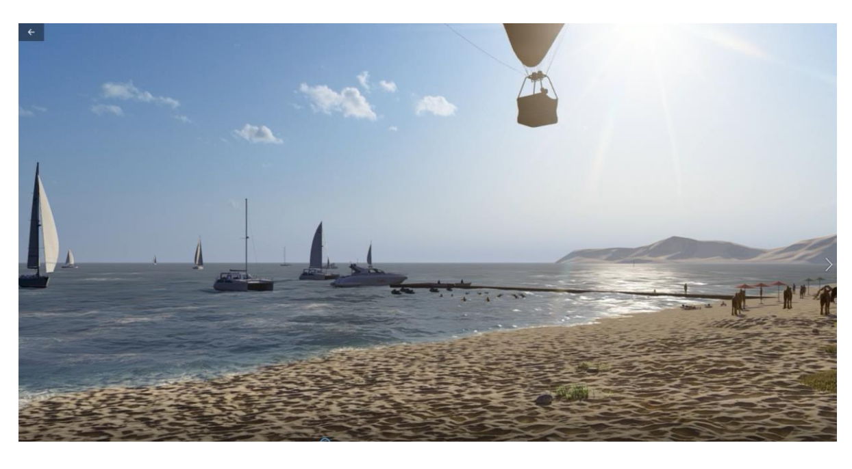
A conceptual for Water Sports facilities in Model beach park