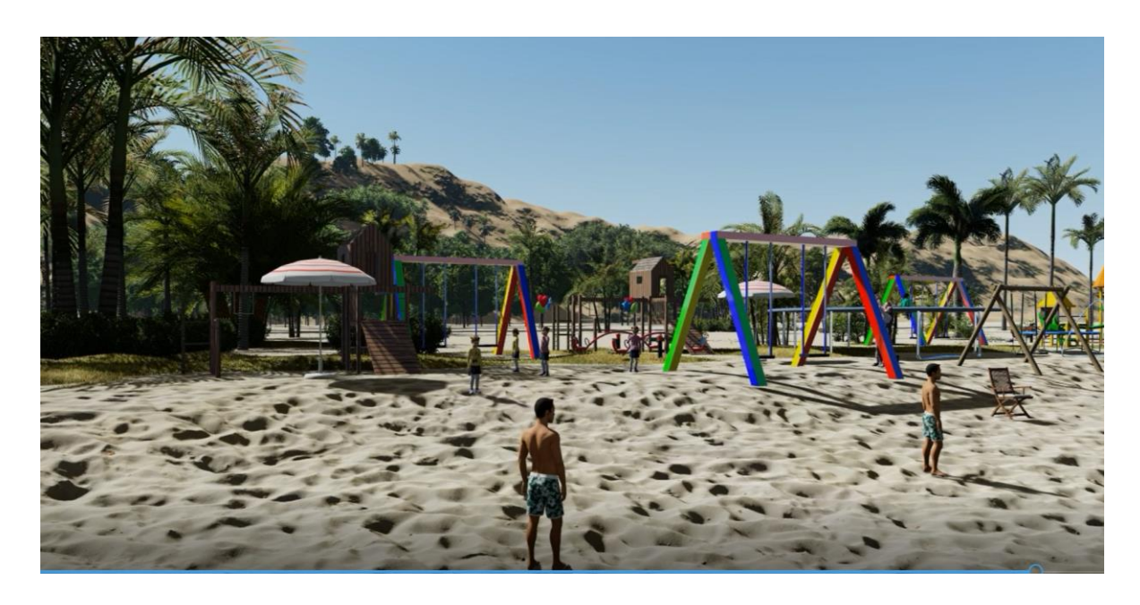
A Conceptual Scheme of beach play equipment (Beach Model park)

Based on the above minimum requirements, it is expected that investor/s will benefit from the economic uplift of the Gwadar & expand their business in phase out manner.