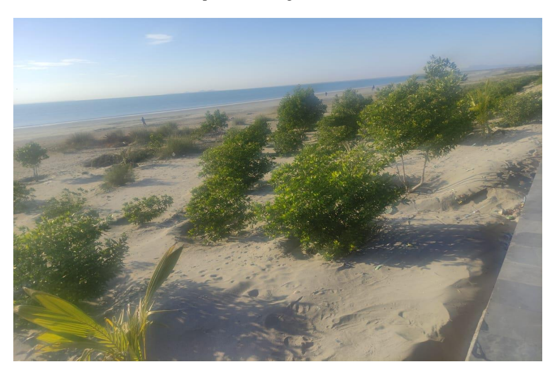
View of beach Park water front (proposed location)