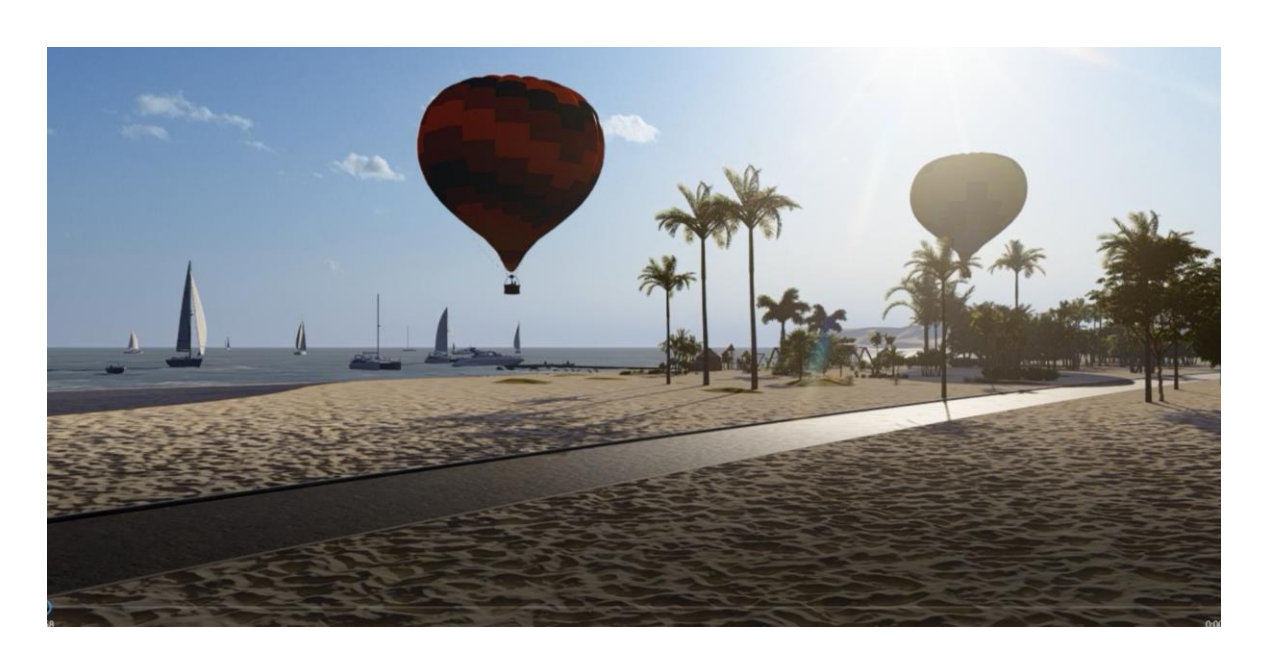
A Conceptual Scheme of Water sports