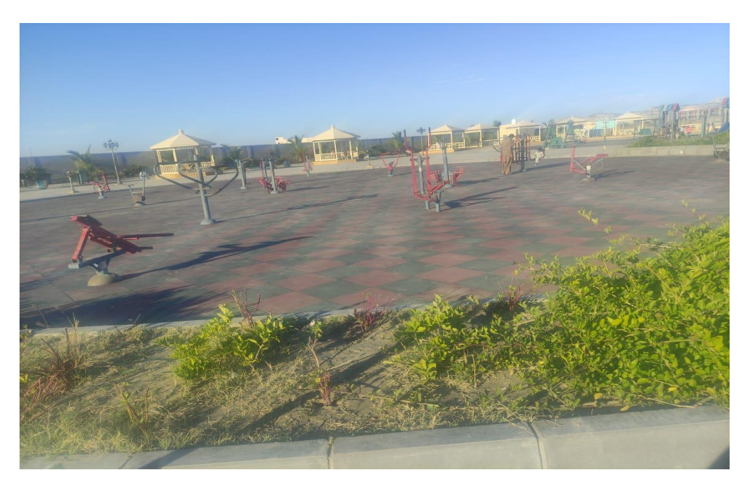
Children Play areas (Model Park)

(Note: The JV is for the Phase 1 of the Project, subsequent phases will be considered at later stage)